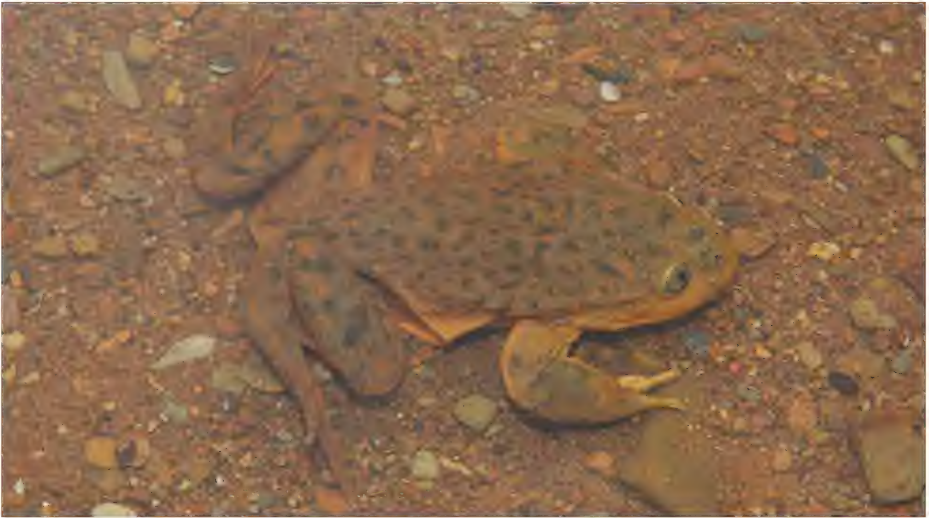
Fig. 1. Adult male of Telmatobius rubigo in its natural habitat in the locality of Santa Catalina, Jujuy province, Argentina.

de Los Pozuelos basin (Barrionuevo and Abdala 2018; Barrionuevo and Baldo 2009). This fully aquatic frog has a unique feeding behavior among anurans, using a specialized feeding mechanism of inertial suction to capture their prey (Barrionuevo 2016). Beyond this singular prey capture mechanism, the knowledge about the trophic ecology of this species remains incomplete.